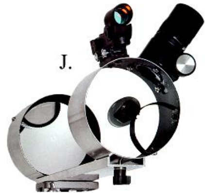
No mount present