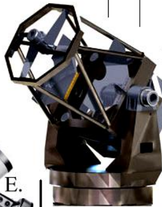
Big professional telescope